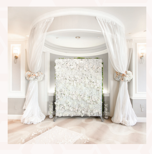
$200 each Rental good for entire length of wedding package